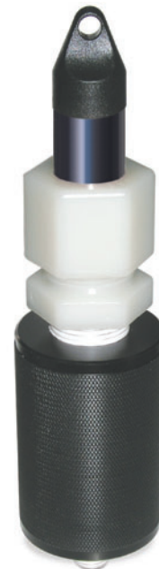
NPT Adaptor with Levellogger Installed

®Solinst is a registered trademark of Solinst Canada Ltd.