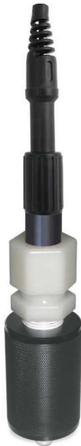
NPT Adaptor with Levellogger Installed and Connection to Direct Read Cable