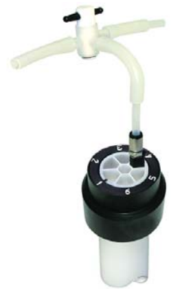
Data courtesy of Paul Sojka, Pollution Control Manager, Worcestershire County Council, UK

A channel seal assembly allows attachment of a three-way valve to direct vapor to a pressure gauge connected at one end of the valve and a sample vessel at the other.