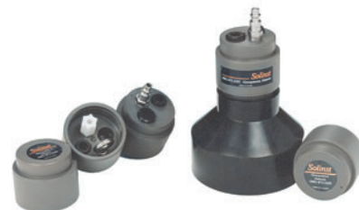
Dedicated Well Caps 2" and 4" (50 mm and 100 mm)

The caps slip easily onto 2" dia. (50 mm) wells. Adaptors to fit 4" dia. (100 mm) or other well sizes are also available. The cap seals in place with an o-ring, and comes with a wire connected protective cover. Low profile wellheads are also available for flush mount casing applications.