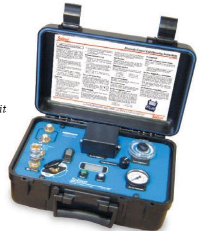
Electronic Control Unit Model 466

The pump is quick to disassemble and the bladders and screens are simple to replace in the field. No tools required. Inexpensive polyethylene bladders can be quickly replaced to suit regulatory requirements.