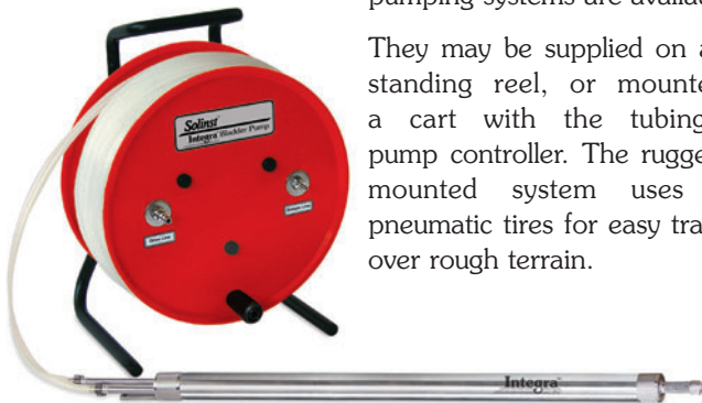
Bladder Pump Stainless Steel 1" (25 mm) on Free-standing Reel

For less frequent sampling, and to allow access to multiple monitoring wells, even in remote locations, portable Integra pumping systems are available.