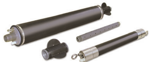
Model 800 Packers 3.7" and 1.8" (94 mm and 46 mm)

Model 800 Low-Pressure Packers can be used with Integra Pumps to minimize purge times by reducing purge volumes. This reduces the cost of water disposal and labour. Packers are available in single point or straddle packer designs, and in sizes to fit 2" ( 50 mm) to 5" (127 mm) dia. wells. (See Model 800 Data Sheet.)