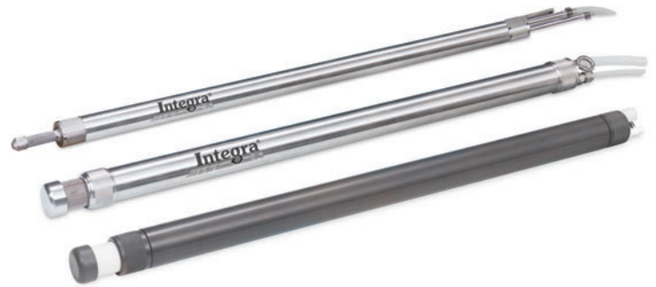
Integra Bladder Pumps available in Stainless Steel 1" and 1.66" (25 mm and 42 mm) or PVC 1.66" (42 mm)

The pump body of the standard Integra is a convenient 1.66" dia. (42 mm) and comes in lengths of 2 ft and 4 ft (0.6 m and 1.2 m). 1" dia. (25 mm) bladder pumps are also available for narrower applications and for use in the Waterloo Multilevel System. (See Model 401 Data Sheet.)