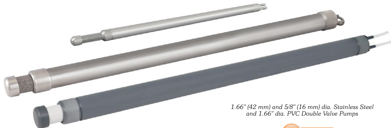
1.66" (42 mm) and 5/8" (16 mm) dia. Stainless Steel and 1.66" dia. PVC Double Valve Pumps