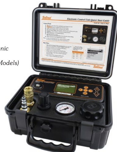
Model 464 Electronic Control Unit (125 psi and 250 psi Models)

The Control Units are supplied in a convenient rugged box, suitable for all environments. Quick-connect fittings allow easy, instant attachment to dedicated well caps or portable reel units, and to an air compressor or compressed gas source.