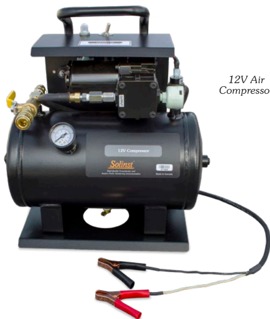
12V Air Compressor