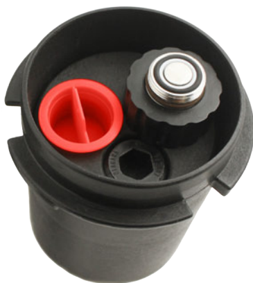
Well Cap with Single Levellogger Direct Read Cable Installed (two additional access holes available for monitoring)