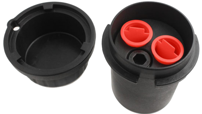
Standard 2" Locking Well Cap with dust plugs Top View

When installing Levelloggers using a Direct Read Cable, the cable simply fits inside the convenient well cap insert hole, when the red dust cap is removed. For Levellogger installations where a Barologger is to be installed in the same well, the well cap supports up to two Direct Read Cables. Even with the two Direct Read Cables installed, there is still an access hole available for manual water level measurements or groundwater sampling, without disturbing the down-hole Levelloggers.