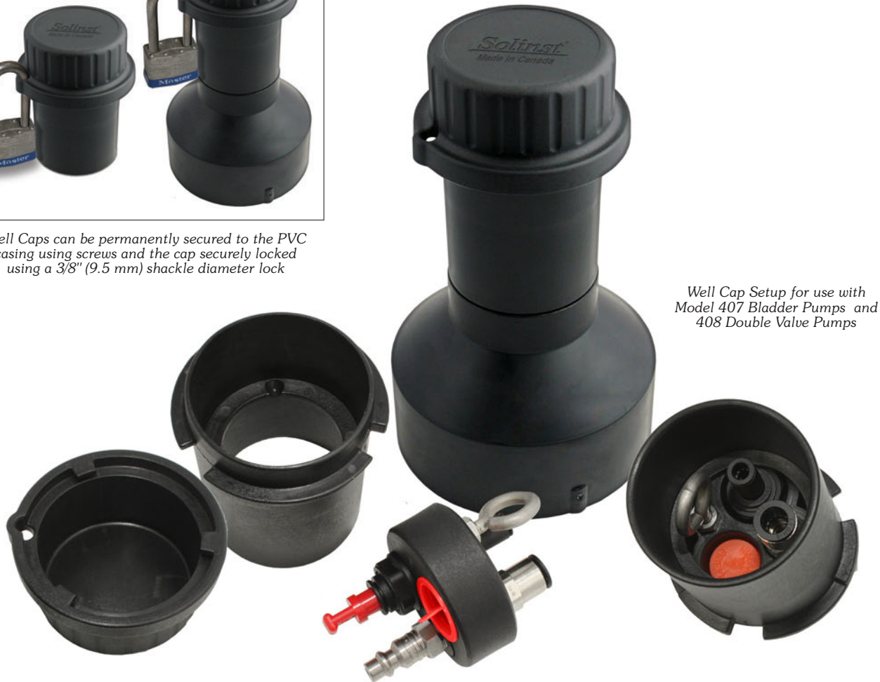
Well Cap Setup for use with Model 407 Bladder Pumps and 408 Double Valve Pumps