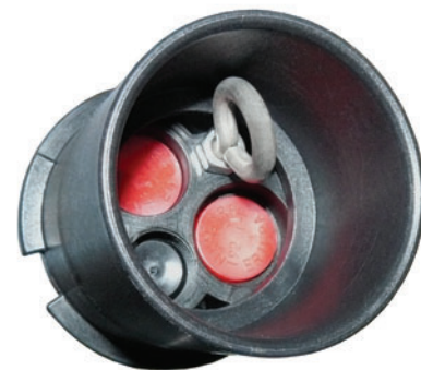
Bottom View shows eyebolt used to secure pumps and transducers