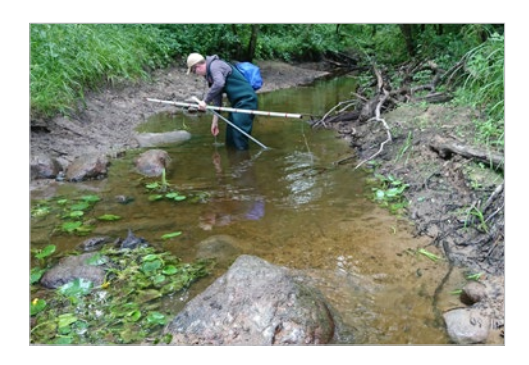
Estimating Ecological Flow

Today, Leveloggers are not only helping track groundwater resources in Lithuania but are also being used in a number of surface water monitoring projects.