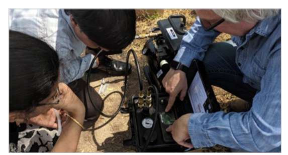
For more details, read the full post in our ON THE LEVEL Blog.