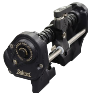
Solinst Model 101 Lateral Winder (#116671)