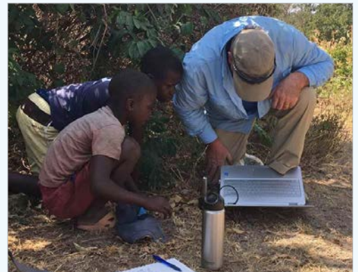
Programming a Solinst Levellogger

Maji Walinzi works with local and national groups, including the Water Resources Management Authority (WRMA) in Kenya, to provide equipment and training to monitor groundwater resources. A major goal of this organization is to establish a large, long-term groundwater monitoring network across rural villages.