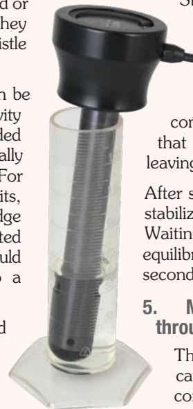
The LTC Levelogger Edge must be connected to an Optical Reader during calibration

Generally, you should keep the solution between 10 and 30°C for best accuracy. Solution temperature should be kept stable throughout the calibration.