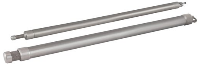
Solinst Bladder Pumps available in Stainless Steel 1" and 1.66" (25 mm and 42 mm).