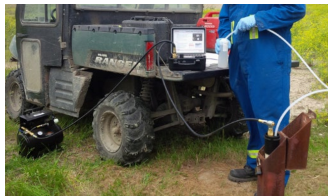
Sampling with a Dedicated Bladder Pump using Portable, Rugged, Easy-to-use, Compressor and Controller

For water level monitoring there is an access hole to fit a Solinst Model 101 Water Level Meter or Levelogger. An eyebolt is provided for a pump support cable or for suspension of a Solinst Levelogger, (see Model 3001 Data Sheet) or other device.