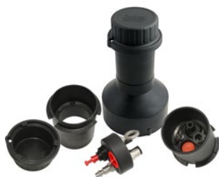
Well Caps for Dedicated Pumps

The caps slip easily onto 2" dia. (50 mm) wells. Adaptors to fit 4" dia. (100 mm) wells are also available. They have quick-connect fittings for the drive and sample tubing.