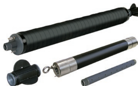
Model 800 Packers 3.9" and 1.8" (99 mm and 46 mm)

Model 800 Low-Pressure Packers can be used with Solinst Bladder Pumps to minimize purge times by reducing purge volumes. This reduces the cost of water disposal and labour. Packers are available in single point or straddle packer designs, and in sizes to fit 2" (50 mm) to 5" (127 mm) dia. wells. (See Model 800 Data Sheet.)