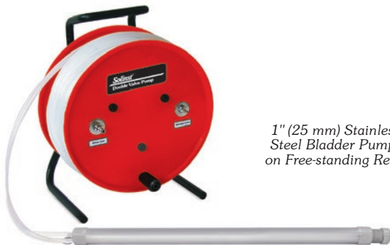
1" (25 mm) Stainless Steel Bladder Pump on Free-standing Reel

They are supplied on a free-standing reel. The rugged systems are very convenient and easy to transport. Tubing fittings on the reels and controller are compression fittings, allowing quick set up in the field. The Solinst Model 103 Tag Line can be used to lower and support the pump in the well (see Model 103 Data Sheet).