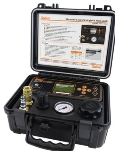
Model 464 Electronic Control Unit (125 psi and 250 psi Models)

These convenient Controllers are rugged, dependable and suitable for all environments. Quick-connect fittings allow instant attachment to dedicated well caps, portable reel units and to an air compressor or compressed gas source.