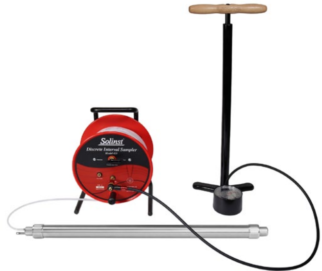
1.66"ø Discrete Interval Sampler with High Pressure Hand Pump

Biodegradable disposable PVC bailers and stainless steel Point Source Bailers are also available from Solinst (see Model 428 BioBailer & 429 Point Source Bailer Data Sheets).