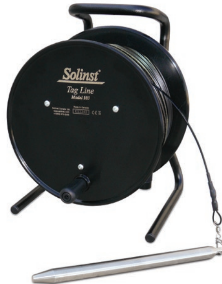
Tag Line / Suspension Cable