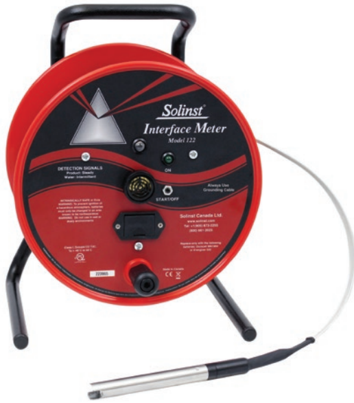
Oil/Water Interface Meter