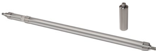
425-D Deep Sampling Discrete Interval Sampler and Weight