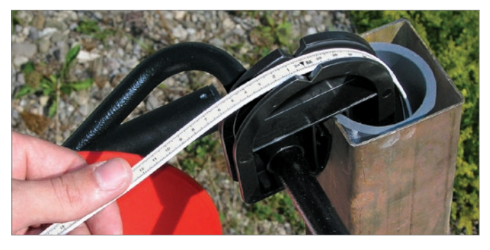
A Tape Guide allows depth measurements to be read at the marked position on the Tape Guide, to give reliable, repeatable, accurate depth measurements when profiling a well. The Tape Guide protects the tape from damage on rough edges of well casing.

Temperature readings are read off the LCD display. As the probe is lowered to take temperature measurements at discrete depths, the buzzer can be turned off by pressing the button two times quickly. This is ideal when profiling temperature.