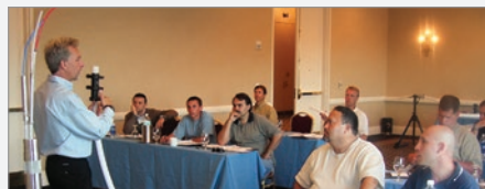
Instructing drilling contractors and consultants on CMT installation techniques at Battelle Bio-Symposium, Baltimore, Maryland.