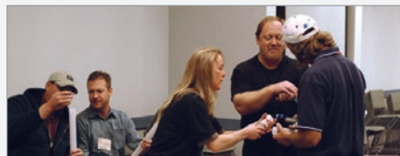
The first CMT contractor training course, conducted at the NGWA Expo in Las Vegas, December 2004. Contractors are being instructed on proper port construction.