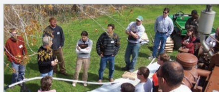
Outdoor installation/ demonstration at premises of Parrat-Wolff, Environmental and Geotechnical Drilling Services, Syracuse, New York.