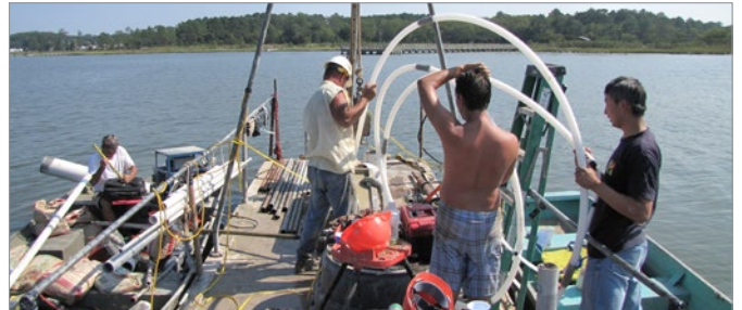
CMT Systems were installed at the bottom of a bay to measure submarine groundwater discharge. Eight 7-Channel CMT Systems were installed, with custom modifications to suit the open water application. Watertight wellheads had to be custom built to allow for sampling from the surface of the bay using a peristaltic pump.