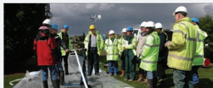
CMT Installation and training as part of a “Multilevel Course” given by the University of Cranfield at Silsoe, U.K., in conjunction with Waterra (UK), British Geological Survey & Norwest Holst.

Please contact Solinst should you wish to attend or set up a training session.