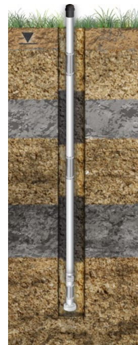
Typical 3 or 7-Channel CMT Installation in Overburden using Layers of Bentonite and Sand Backfilled from Surface