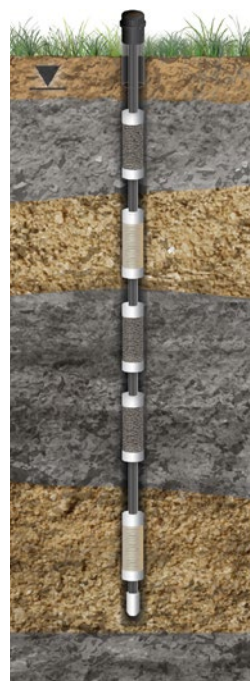
Typical 3-Channel CMT Installation in Overburden with Bentonite and Sand Cartridges

Saves Cost – through reduced permitting and drilling costs; and because narrow tubes allow smaller purge volumes, reduced disposal costs, efficient low flow sampling and rapid response to pressure changes, all reduce field time.