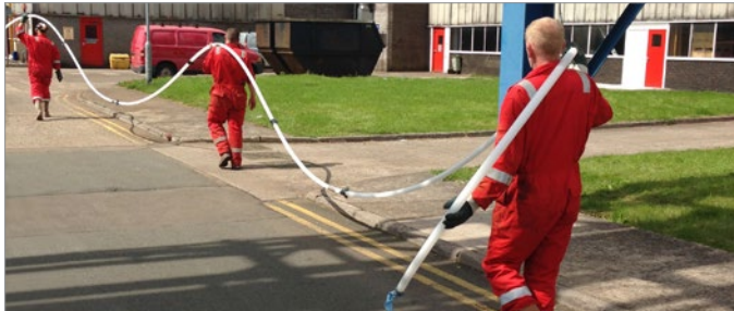
Nineteen 7-Channel CMT Systems were installed inside a manufacturing facility to characterize and monitor a plume beneath the building that is migrating off site. Systems were installed using sonic drilling to 30 m depths. Challenging geology made drilling and installation tricky, however, all Systems were installed in two weeks.