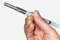
Model 408M DVP 3/8" (9.5 mm)