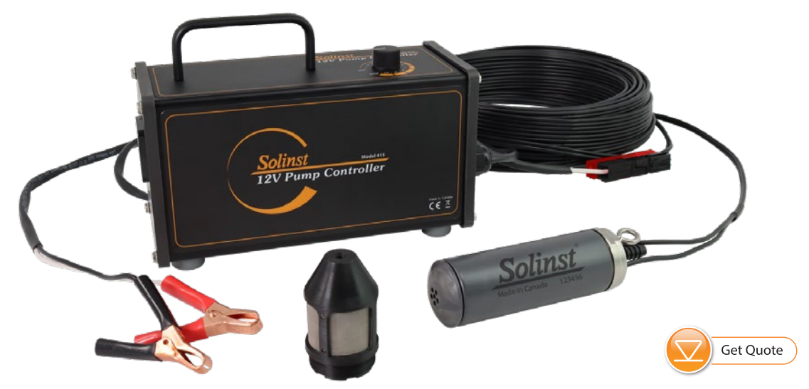
(Optional Water Filter)