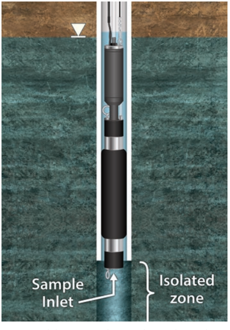
A Model 800M Packer can be used to isolate the sampling zone and reduce purge volumes.

Dedicated 2" Well Cap: For long-term monitoring projects and to avoid cross-contamination or decontamination between wells, a 2" well cap assembly is available for dedicated deployment of the 12V Pump. The assembly includes a hanger bracket to support the Pump weight