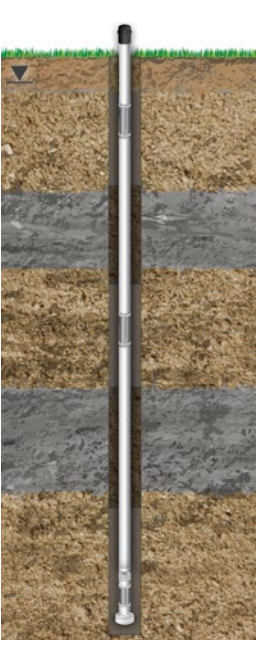
Typical 3 or 7-Channel CMT Installation using layers of bentonite and sand backfilled from surface.