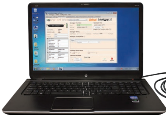
PC Interface Cable