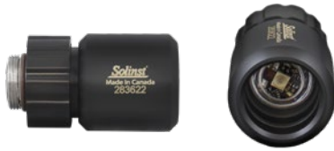
L5 Slip Fit Adaptor (#114598)