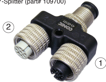
Y-Splitter (part# 109700)

The connections for Leveloggers on the RRL Stations are identified as Right and Left in the RRL Gold Software. This assumes the RRL Station is facing with the black label towards you. When using a Splitter, the number 1 or 2 will identify the Leveloggers. The numbers 1 and 2 are labeled directly on the Splitter.