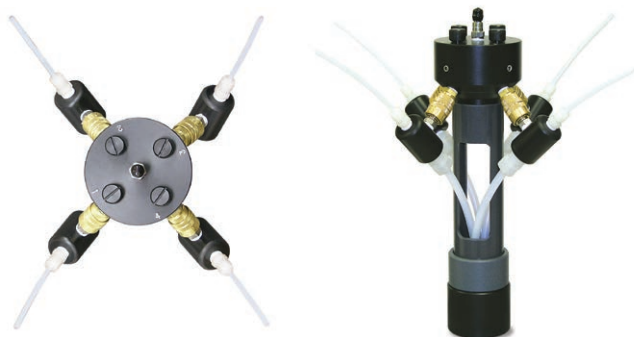
Top and Side View of Multi-Purge Manifold with 4 Pumps Connected.