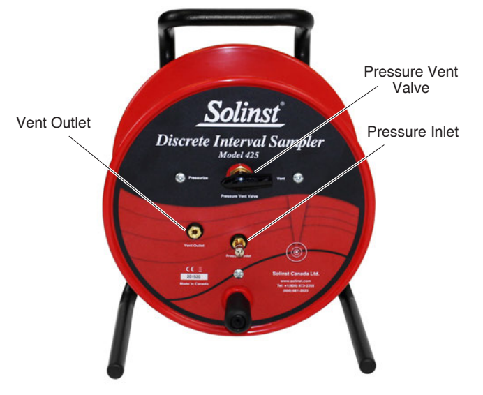
Model 425 Discrete Interval Sampler Tubing Reel