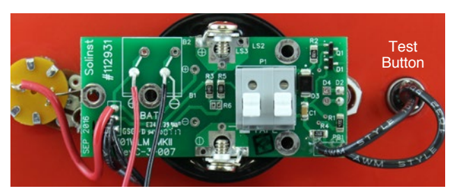
Test Button Connections – Mk2 with New Style Light