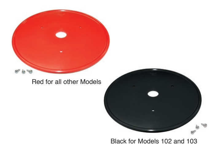
Red and Black Replacement Backplate Assemblies

Note: Model 122 Interface Meters will have an additional washer over the centre rod that is connected to the ground cable. Remove this washer as well.